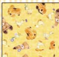
21160 S (includes backing)