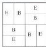
Diagram Block 3