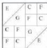
Diagram Block 1

Two (2) 53 1/2" by 1 1/2" strips from fabric A.