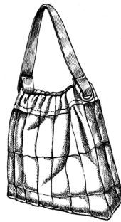
Cotton Belting Handle