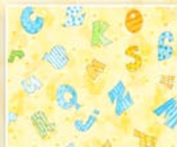
FABRIC G 29182-548 NQ: 1/4 YARD SQ: 1/2 YARD