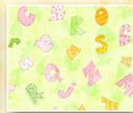
FABRIC G 29182-738 NQ: 1/4 YARD SQ: 1/2 YARD