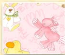
FABRIC C 29178-325 SQ: 7/8 YARD