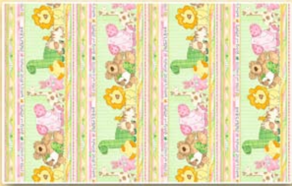
FABRIC B 29177-735 SQ: 7/8 YARD