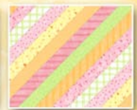
FABRIC h 29183-371 NQ: 2/3 YARD SQ: 2/3 YARD (INCLUDES BINDING)