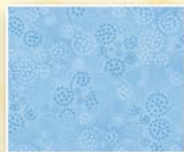
FABRIC J NEW ESSENTIALS Q1817-39055-444 NQ: 3/8 YARD SQ: 1/2 YARD