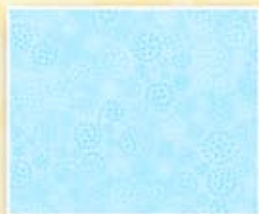
FABRIC I NEW ESSENTIALS Q1817-39055-400 SQ: 1 1/4 YARDS (BACKING ONLY)