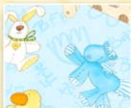
FABRIC C 29178-425 SQ: 7/8 YARD