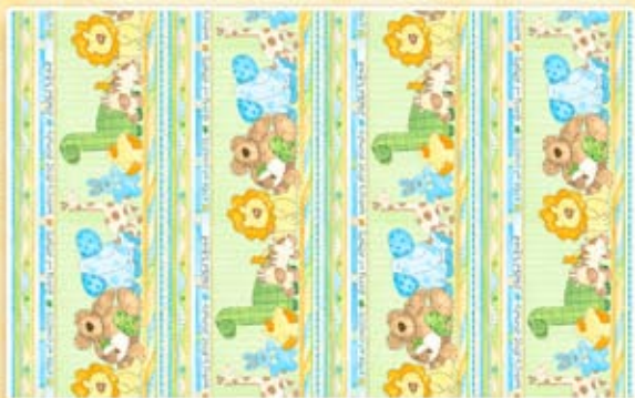
FABRIC B 29177-745 SQ: 7/8 YARD