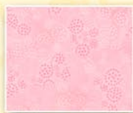
FABRIC I NEW ESSENTIALS Q1817-39055-300 NQ: 3/8 YARD SQ: 1/2 YARD