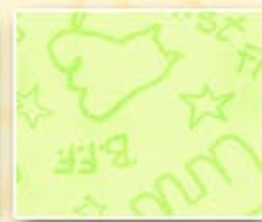
FABRIC D 29179-777 NQ: 3/8 YARD