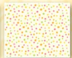
FABRIC K NEW ESSENTIALS Q1817-39065-137 NQ: 1/4 YARD SQ: 1/4 YARD

KIT REQUIREMENTS BASED ON A MINIMUM OF 15 YARDS PER BOLT