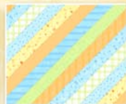
FABRIC h 29183-471 NQ: 2/3 YARD* SQ: 2/3 YARD* (*INCLUDES BINDING)