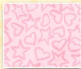
FABRIC F 29181-333 NQ: 1/4 YARD