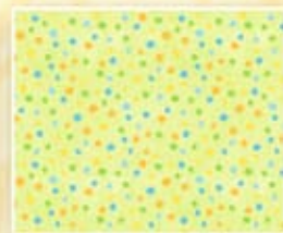
FABRIC K NEW ESSENTIALS Q1817-39065-745 NQ: 1/4 YARD SQ: 1/4 YARD

KIT REQUIREMENTS BASED ON A MINIMUM OF 15 YARDS PER BOLT