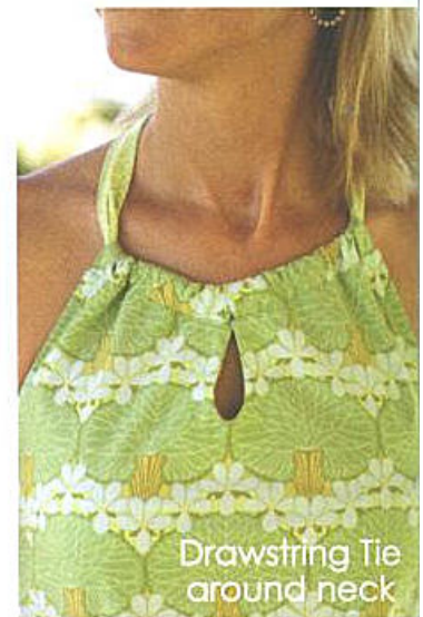
Drawstring Tie around neck