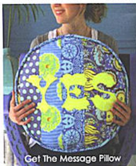
Get The Message Pillow